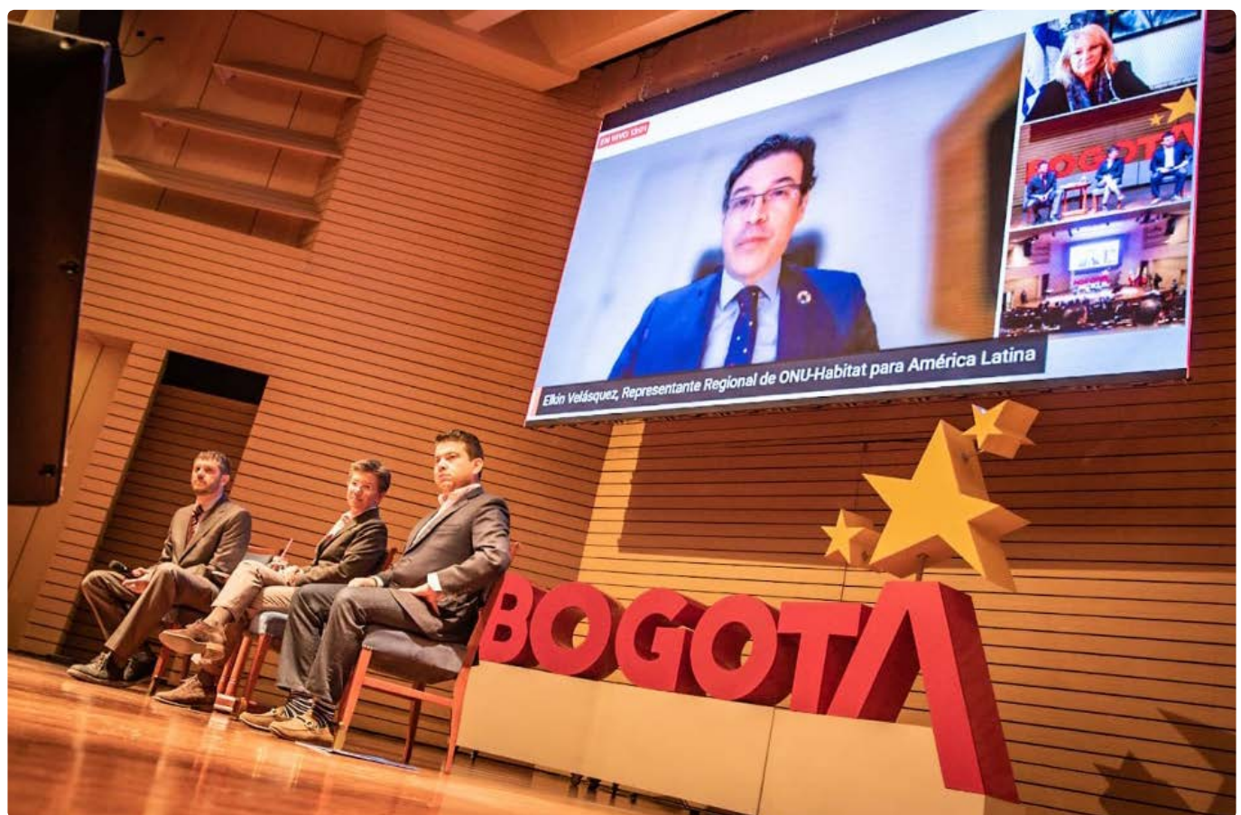
World Metropolitan Day main event in Bogota.

As part of World Metropolitan Day, Bogota, Metropolis and UN-Habitat celebrated a global conversation about the relevance of care as a framework for strengthening metropolitan governance.