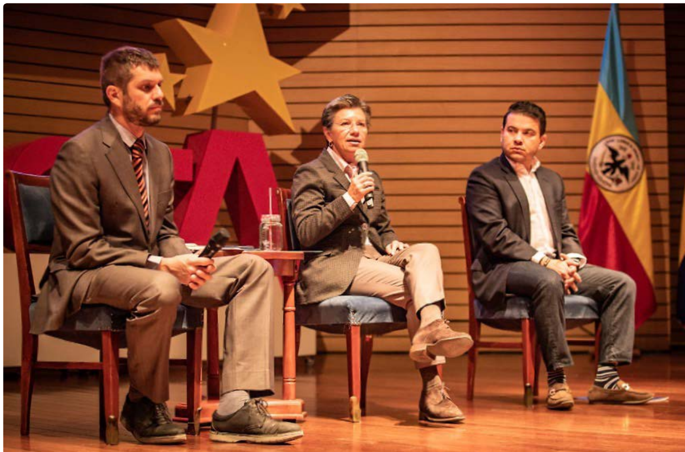
World Metropolitan Day main event in Bogota.