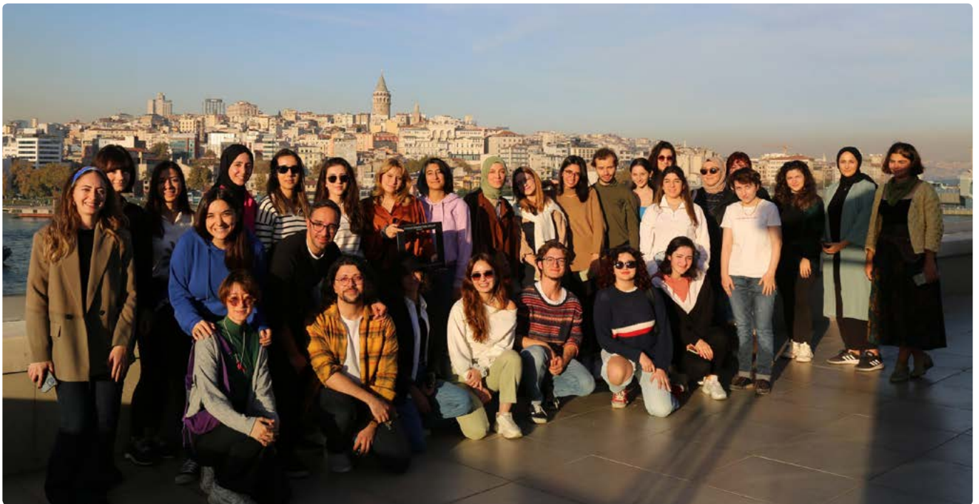
Workshop with young people in the Golden Horn.