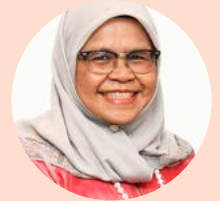
Maimunah Mohd Sharif UN-Habitat Executive Director

At UN-Habitat, we are convinced that recovery from global shocks and our journey towards sustainability will depend on how well we manage metropolitan spaces for generations to come. ”