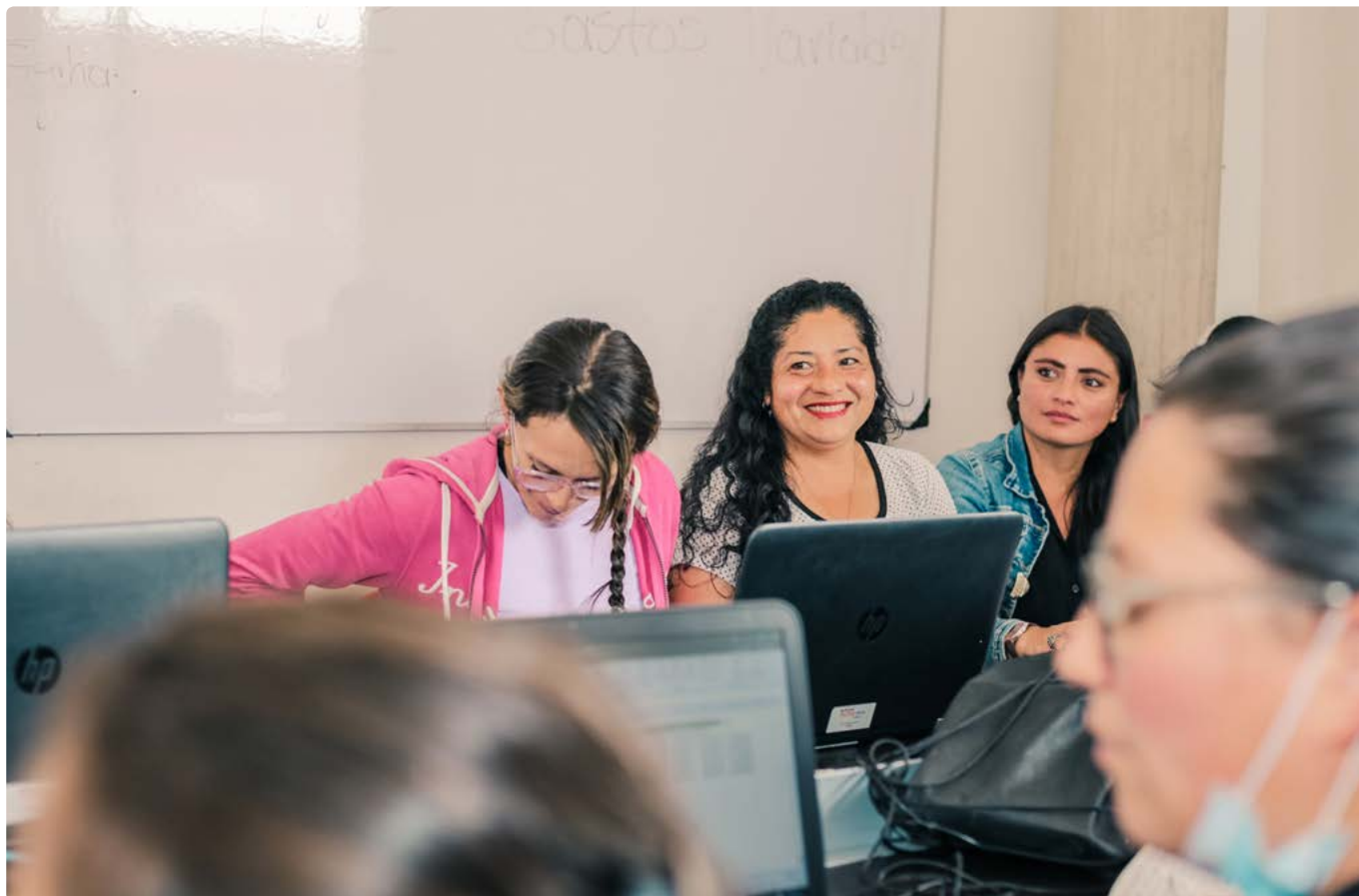
Care Block programme in Bogota.

Mayor Claudia López Bogota's focused the day's dialogue on care and governance. The Mayor explained that it is no coincidence that local care systems are being implemented in Latin America, as half of the population lives in the informal economy, without access to a health or a pension system. As women are the main providers of care, Bogota's care system has a simple objective: to identify women's needs and to respond to them. Bogotá now provides more than 2000 services for women in existing schools, health centres, sports centres, and public offices. The city is, therefore, expanding its services offer, not its infrastructure. According to Mayor López, there is work to be done, but we are on the right track: "Latin America can leave violence and inequality behind in two generations", she announced in closing remarks.